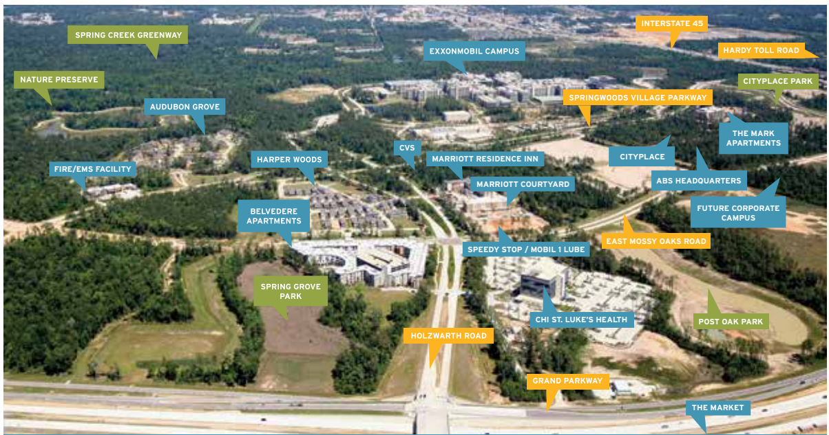
See what's here now and how we're evolving in the near future. For current roads and community access points or to learn more, visit www.springwoodsvillage.com .

Springwoods Village is located at the confluence of I-45, the Hardy Toll Road, and the Grand Parkway. Enter at I-45 and Springwoods Village Parkway.